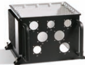
Dip Brazed Chassis