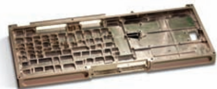
Vacuum Brazed Coldplate for an Antenna Interface Unit

To learn more about our capabilities and brazing, please contact your B/E Aerospace representative or call: